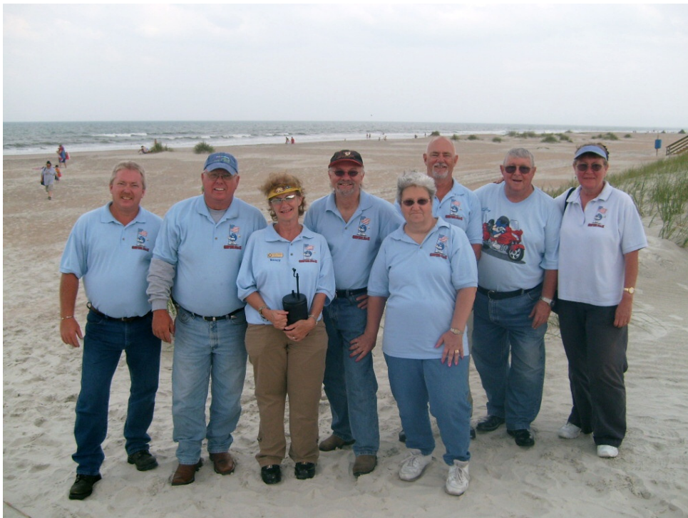
Some of our chapter members posing on the beach at St. Augustine during the sunrise to sunset ride.